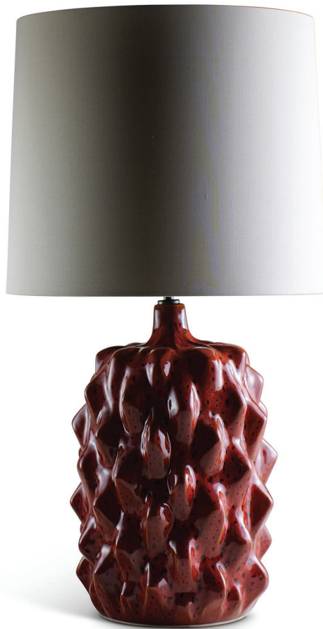
3, Red Magma with Natural linen shade